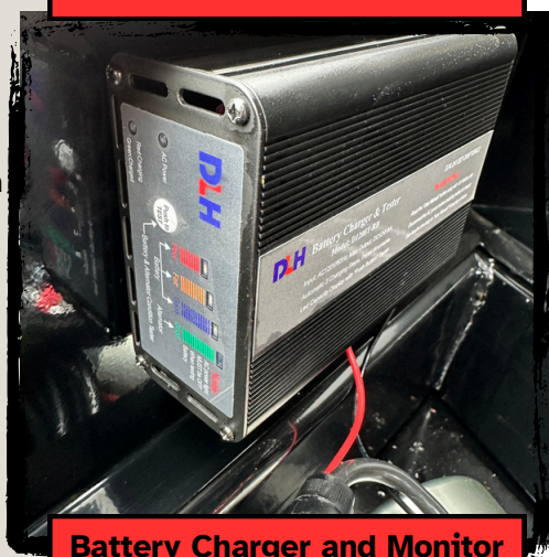
Battery Charger and Monitor